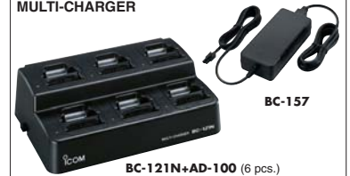
BC-121N+AD-100 (6 pcs.)